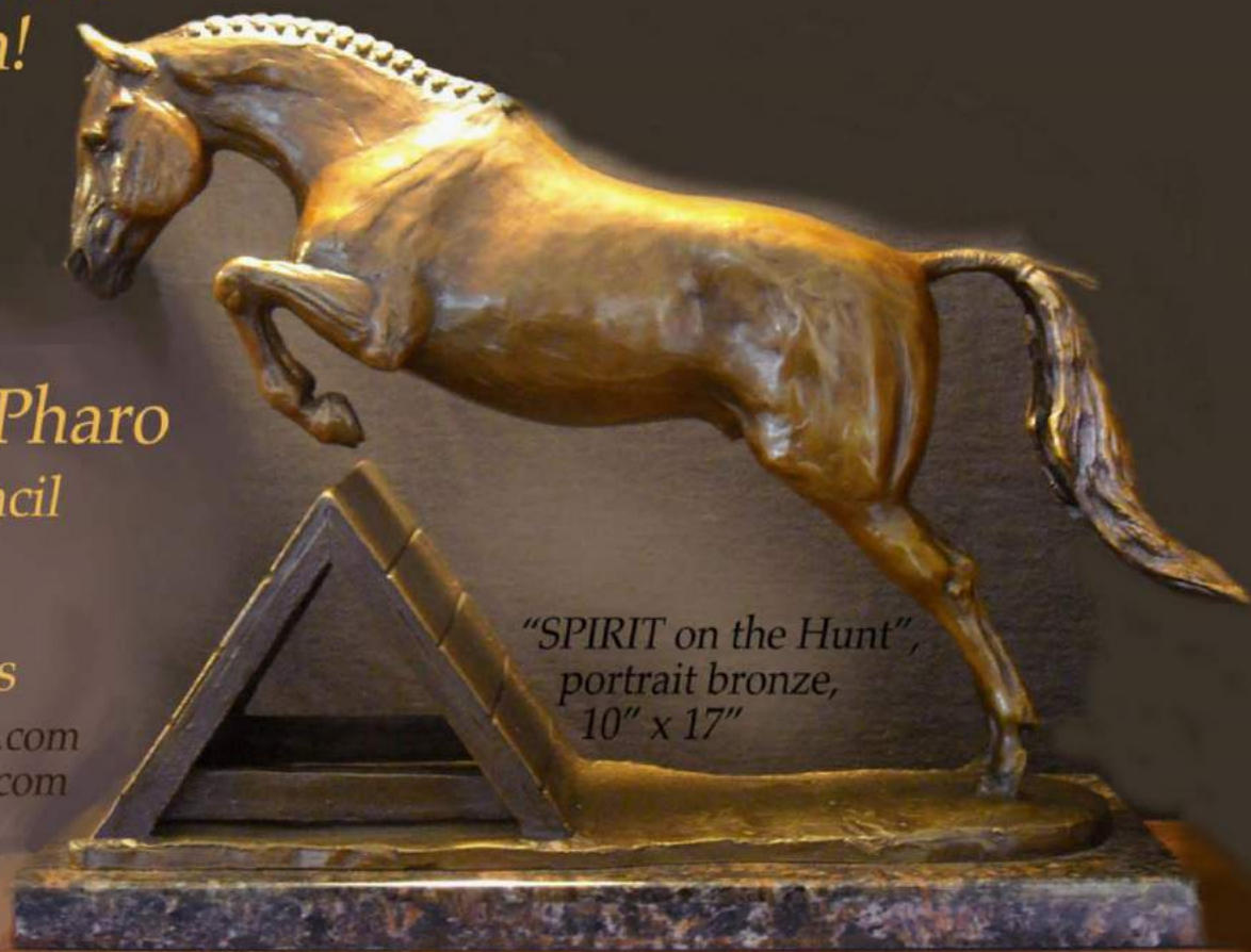
"SPIRIT on the Hunt", portrait bronze, 10" x 17"

www.olvastewartpharo.com portraits@texhorseman.com 281-373-9304