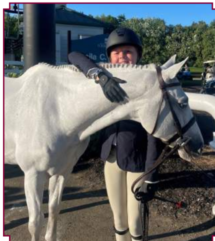
Emmy Canterbury & Bada Bing Bada Blue Champion Small/Medium Children's Pony Hunter