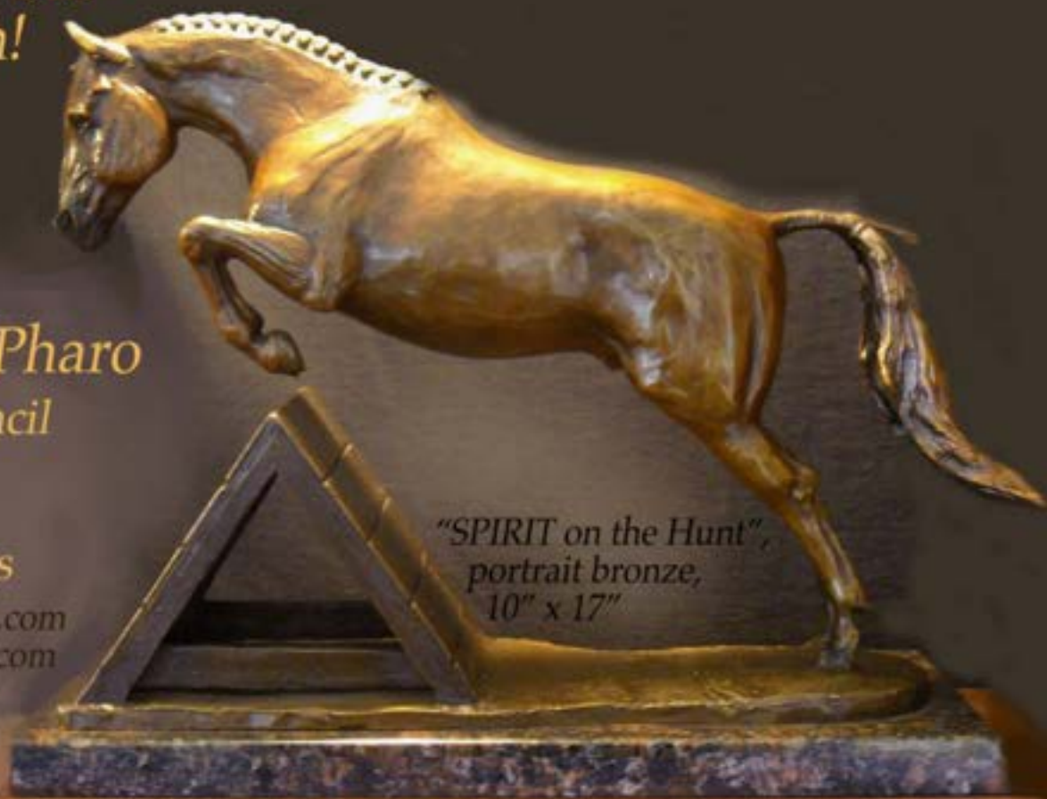
"SPIRIT on the Hunt", portrait bronze, 10" x 17"

www.olvastewartpharo.com portraits@texhorseman.com 281-373-9304