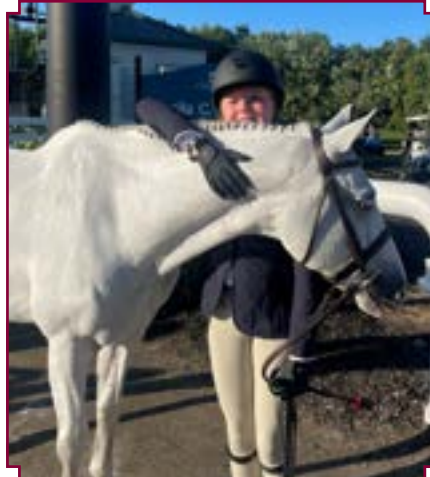
Emmy Canterbury & Bada Bing Bada Blue Champion Small/Medium Children's Pony Hunter