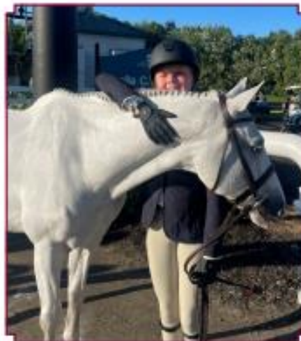
Emmy Canterbury & Bada Bing Bada Blue Champion Small/Medium Children's Pony Hunter